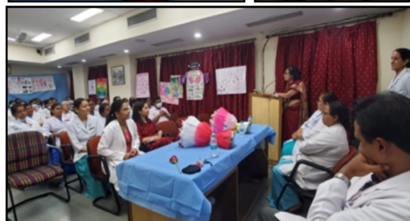
Breast Cancer Awareness month