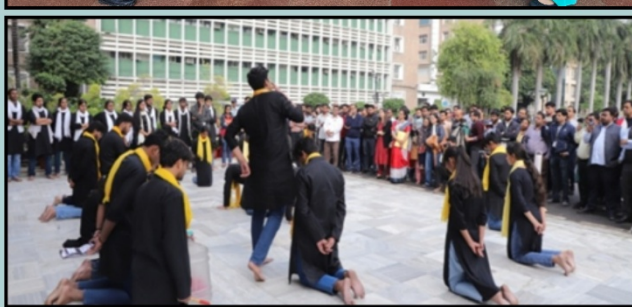
Nukkadnatak / Street play